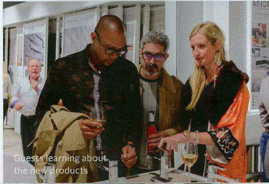
Guests learning about the new products

Porcelanosa celebrated the opening of their new Walnut Creek showroom with approximately 75 guests last November, showcasing their vast selection of tile, bath, hardwood and kitchen collections. The new showroom features an array of full-size bathroom and kitchen displays, allowing both home owners and trade professionals alike to experience Porcelanosa's products firsthand.