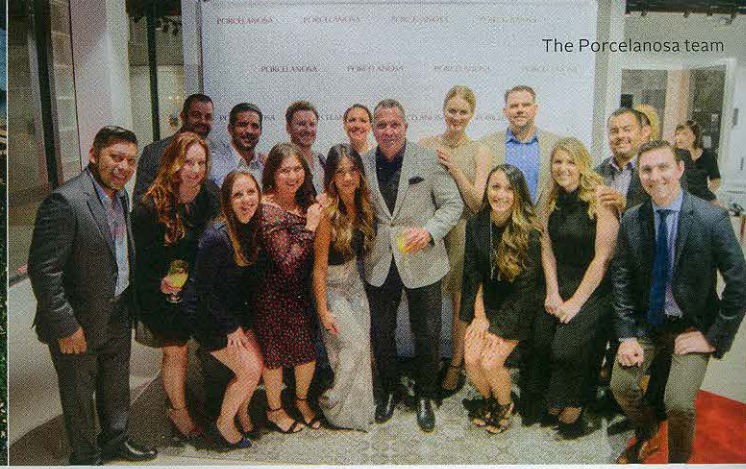
The Porcelanosa team