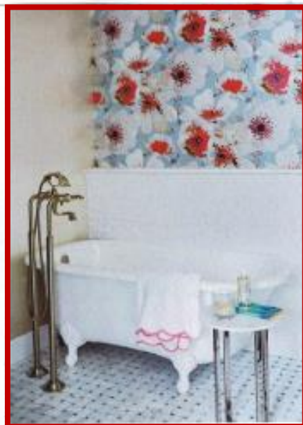
ABOVE: Marmi Blanco tile by Porcelanosa and Eden Amaranth wallcovering from Black Edition create a focal wall behind the tub. Alexi table by Bernhardt. LEFT: A Serif drop-in sink by Kohler is paired with the Charlotte widespread faucet by Brizo. Delilah socones by Worlds Away. Farista mirror by Uttermost. Duverre Pomegranate pulls in Satin Nickel. Custom cabinetry painted in Benjamin Moore's Manor Blue.

ABOVE: Marmi Blanco tile by Porcelanosa and Eden Amaranth wallcovering from Black Edition create a focal wall behind the tub. Alexi table by Bernhardt.